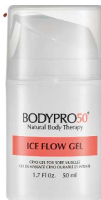
BODYPRO50 Ice Flow Gel bodypro50.com

"This soothed one of my sore joints in seconds flat—I'm sold!"