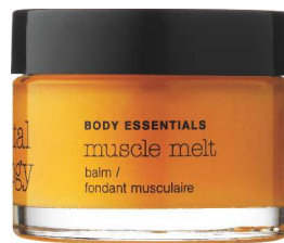
Elemental Herbology Muscle Melt elementalherbology.com

"One application of this warming rub is all it takes to fade my post-workout woes."